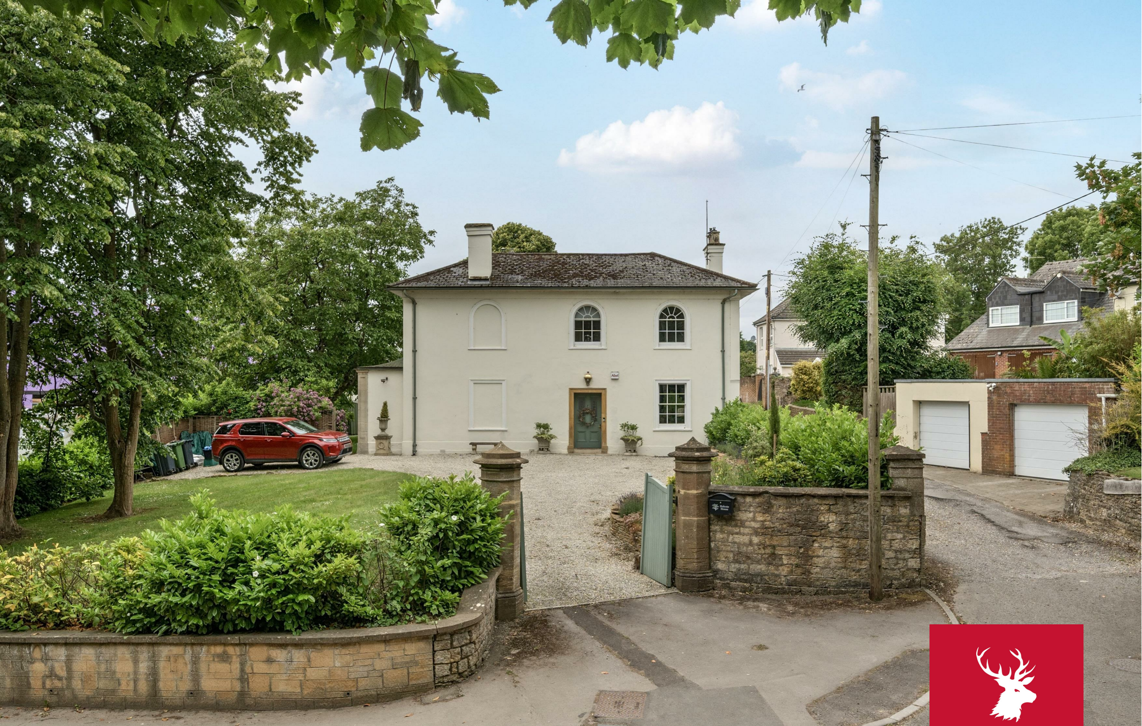
Holcote House, Mudford Road